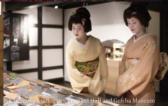
Kanazawa Asanogawa Enyukai Hall and Geisha Museum