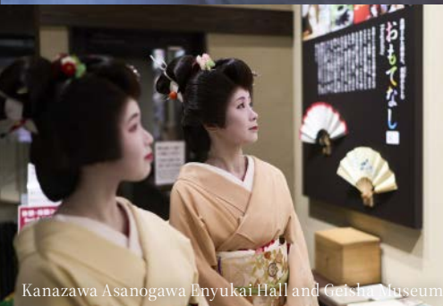
Kanazawa Asanogawa Enyukai Hall and Geisha Museum